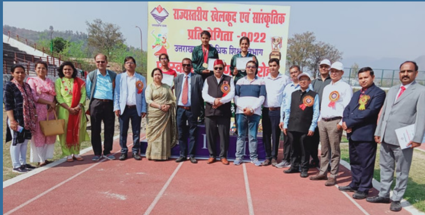
GOLD MEDAL IN GROUP SONG (STATE LEVEL)